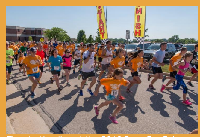
The starting line at the 2016 Race For Soles.

Mark your calendar and invite your friends and family to our fourth annual Race For Soles on June 24, 2017, at 8:30am! We look forward to sharing more details with you soon.