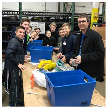
Students from Brookfield Christian School packing shoes for Africa.