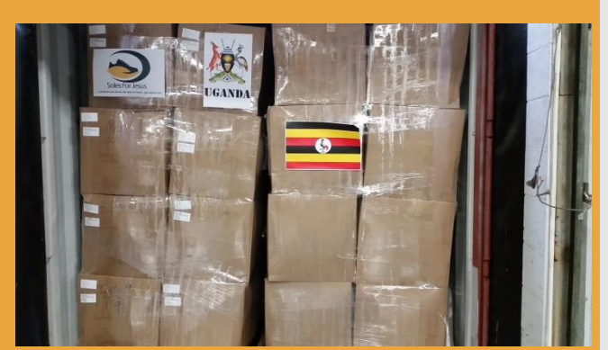
Our first shipment to Uganda is on its way!

We are excited to announce that the shipment of shoes to Uganda is on its way. It left the port of New York on January 14th! We are excited to hear the stories of how God is going to use these shoes to touch people's lives. Please pray for the safe arrival of the shoes. You can view pictures of the Uganda shipment HERE.