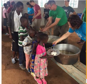
Team Kenya, January 2017