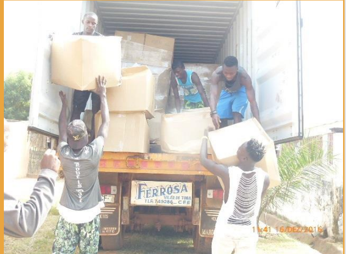
Boxes of shoes being unloaded in Guinea Bissau.

as Lord. View pictures of the shipment to Guinea Bissau HERE .