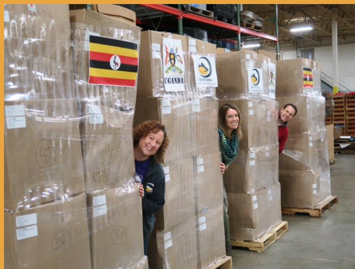
Our first shipment to Uganda is on its way!

We are thrilled to be sending a shipment of shoes to Uganda for the first time! This shipment is being sent in partnership with the campuses of Grace Church in the Dayton, Ohio region. Grace Church has been working with Jaguza Ministries in Uganda for many years to meet the needs of the vulnerable and to share the Gospel throughout the country. We thank the Lord for connecting us and we are excited to see what He will do through these shoes and partnership!