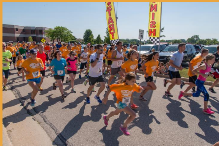
The starting line at the 2016 Race For Soles.

Mark your calendar and invite your friends and family to our fourth annual Race For Soles on June 24, 2016! We look forward to sharing more details with you soon.