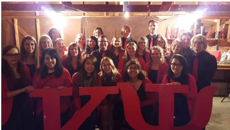
Members of Pappa Psi Zeta Theta