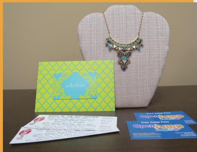
Auction items from Stella & Dot, The Milwaukee Repertory Theater, and Pump It Up.