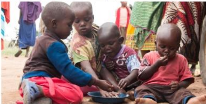
Village feeding with SFJ Team Tanzania.