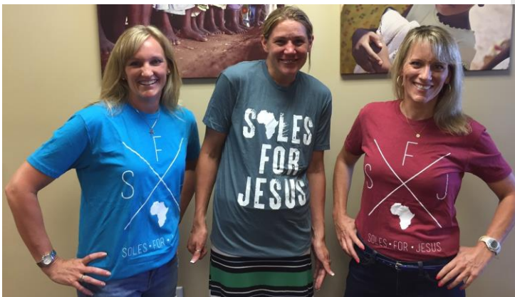
Our beautiful friends rocking their SFJ apparel.

Choose your favorite color and style for only $20 and place your order online at this LINK , by phone at 414-365-1392, or by visiting our office.