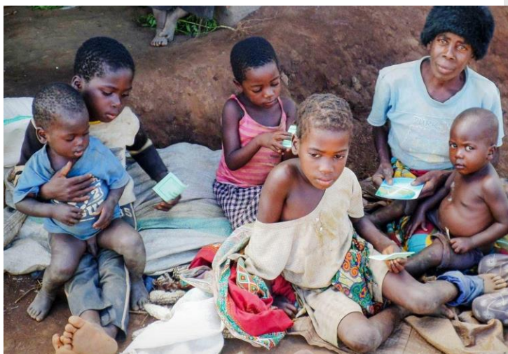
Sharing the Gospel and shoes in Munhacua, Mozambique.