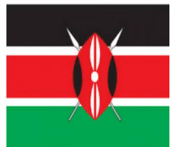
Port of Mombasa, Kenya.