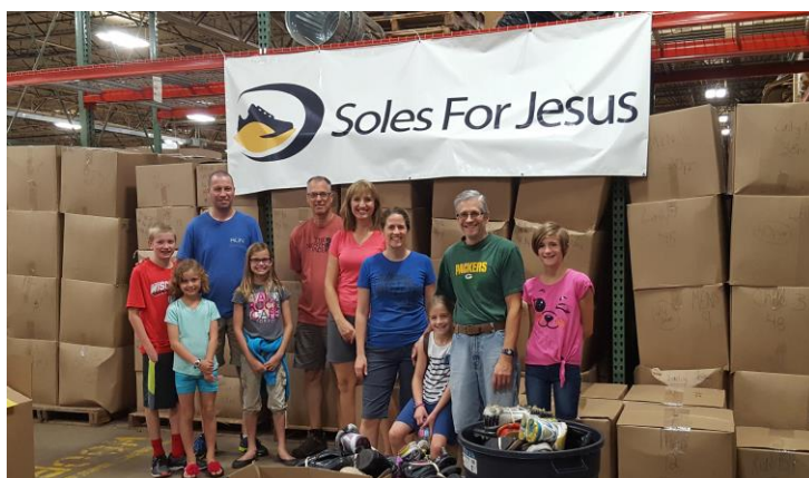
come and volunteer. Friends of SFJ serving at a SOS this month.