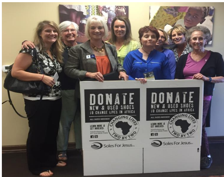
Members of the Butterfly Brunch Committee.