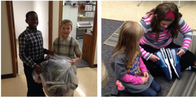
Students at Zion Lutheran School helping sort the shoes.