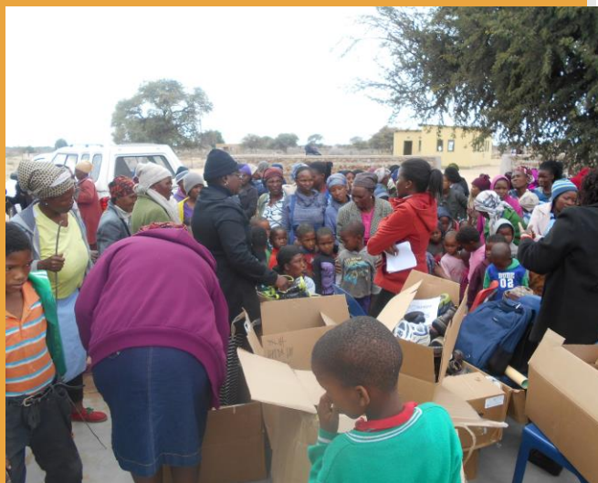
EHC leaders organizing shoes before a distribution.