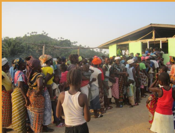
People waiting in line to receive shoes in Lofa County.