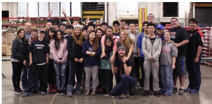
We enjoyed serving with the students of Wisconsin Lutheran High School this month!