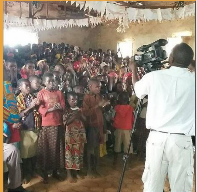
The local news station covering a shoe distribution.

shoes and sharing the Gospel with Rutegame Village. Please pray for God's glory to shine through as the Gospel message is heard, and pray for peace and unity in this nation. View pictures of the shipment HERE .