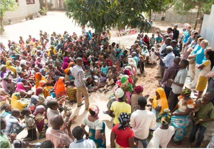
SFJ Team, sharing the love of Jesus in Tanzania.