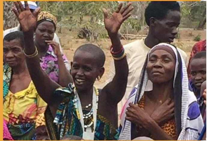
Sharing the love of Jesus in Tanzania.