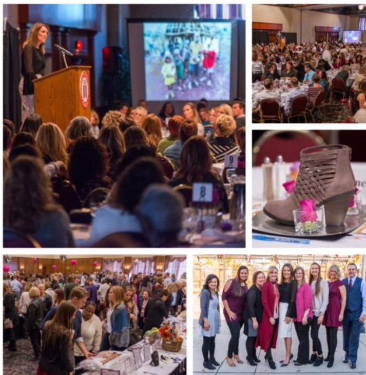
2016 Fashion Show Luncheon

To see more photos from our annual luncheon, click HERE .