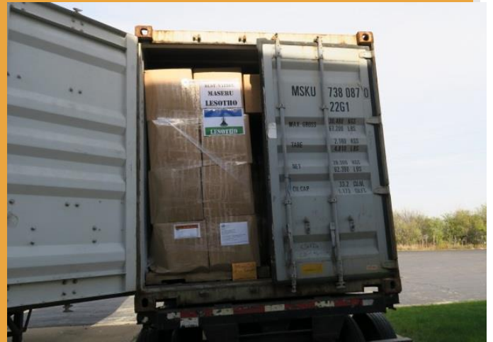
A shipment leaving the SFJ warehouse for Lesotho.

Appleton Alliance and @xcelsports in WI - We are so grateful for our sweet partnership with Appleton Alliance and @xcelsports! They recently finished their annual shoe drive by delivering 1352 pairs of shoes & volunteering in our warehouse! Thank you friends for touching so