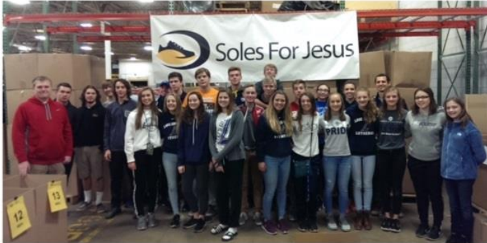
Students from Lake Country Lutheran High School serving at a SOS.