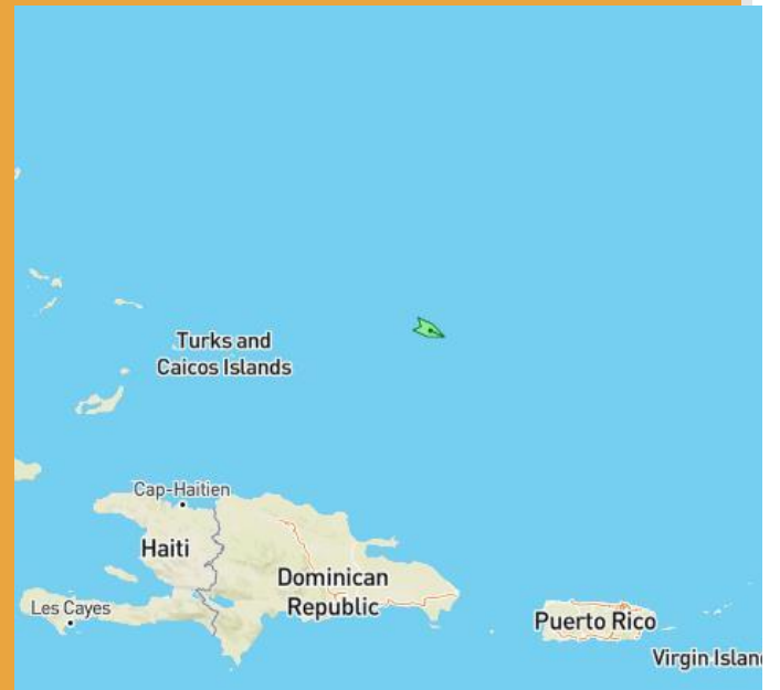
Sailing through the Caribbean.