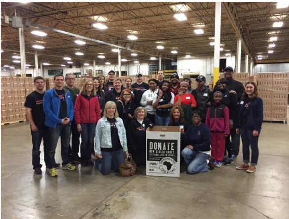
We enjoyed having a group from Kohl's Corporation volunteer at a SOS Event this month!