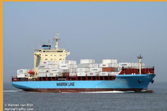
The Maersk Vallvik that is carrying 8,000 pairs of shoes.