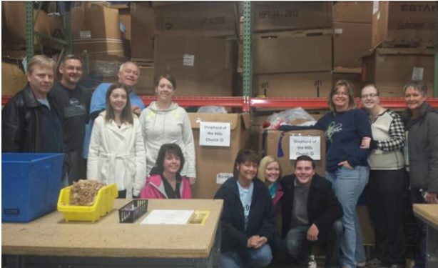
A group from SOTH volunteering at a SOS Event.

Shepherd of the Hills Pewaukee- We appreciate our friends at Shepherd of the Hills Church in Pewaukee! They organized a shoe drive and collected over 600 pairs of shoes! They also raised the funds to help ship the shoes to Africa, and they brought a group of volunteers to SFJ's warehouse to pack the shoes for Africa. Thank you for your efforts and generosity!