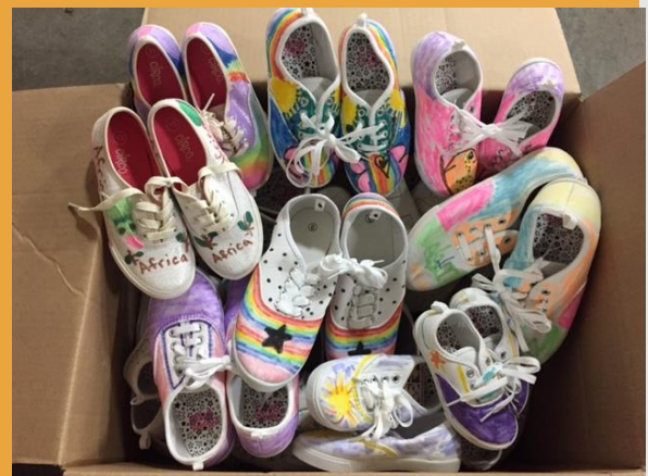
Shoes decorated by students at Brookfield Academy.