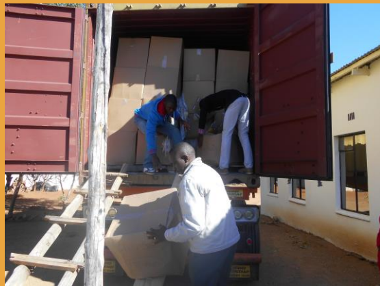
The EHC team unloading the boxes of shoes from the container.