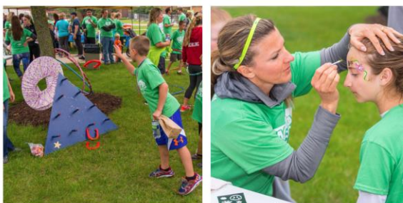
Participants having fun at Race For Soles.