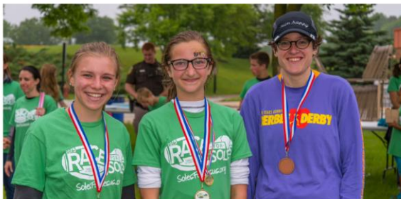
1st, 2nd, and 3rd place runners.