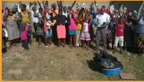
Celebrating shoes and Jesus in Swaziland.