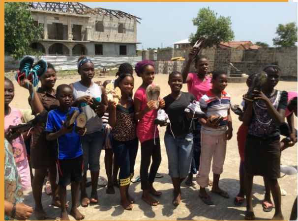
Children from, "Love a Child Orphanage" with their shoes.