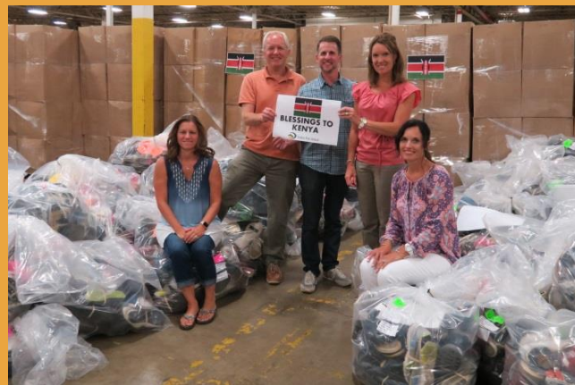
Soles For Jesus Board of Directors with the Kenya shipment.

On July 26 th a shipment of over 8,000 pairs of shoes was shipped to Nairobi, Kenya. In December, a mission team is going to help distribute these shoes while ministering in the Kitui region of Kenya. Please join us in prayer that people will open their hearts to hear the Gospel and commit their lives to Jesus. We are excited to see how God will use these shoes to further the work of His Kingdom in Kenya. View pictures of the Kenya shipment HERE .