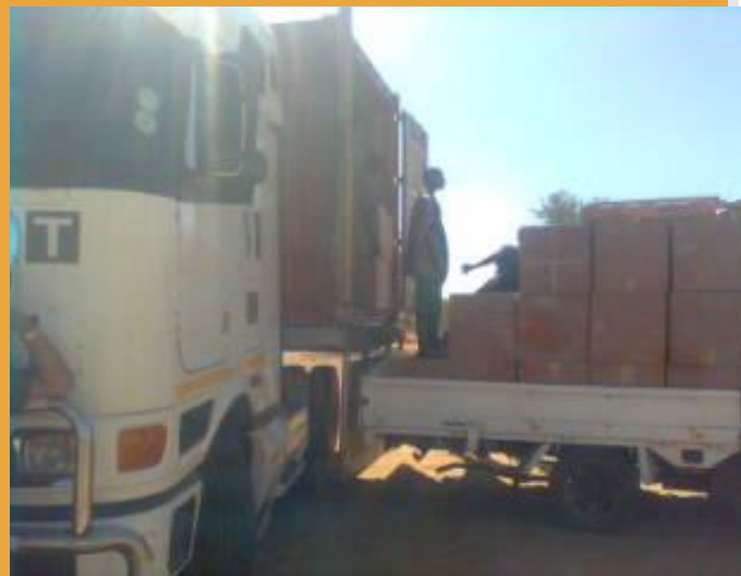
The EHC Team unloading shoes from the container.