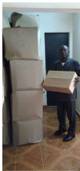
Unloading the Burkina Faso shipment.