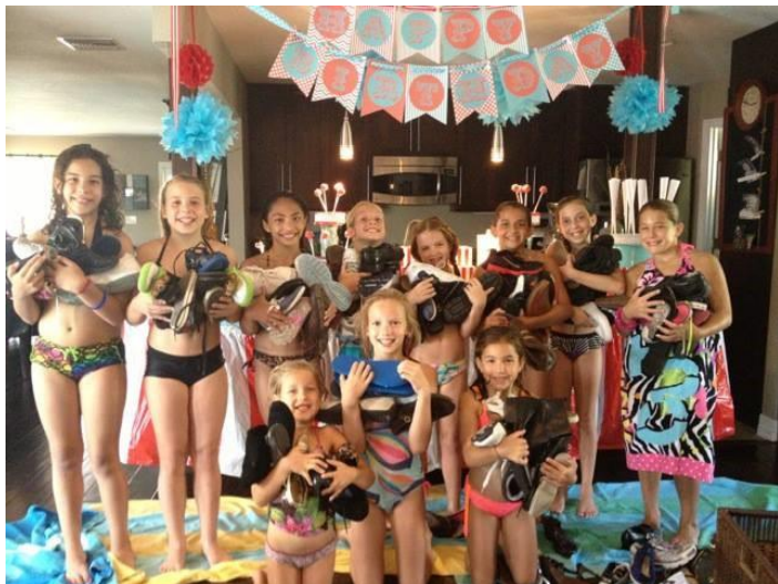
Birthday swim party, where shoes were donated instead of gifts- wow!