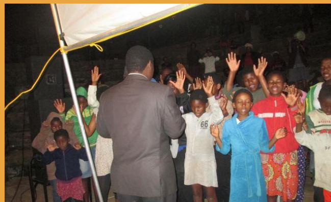
People worshipping Jesus at a shoe distribution.

We are extremely grateful for those who help collect shoes and also raise funds to help send them to Africa. Funds and shoes are two key needs that we have, and we're often asked for creative ideas to help engage a group. Click HERE for some easy and fun ways to get everyone excited and involved!