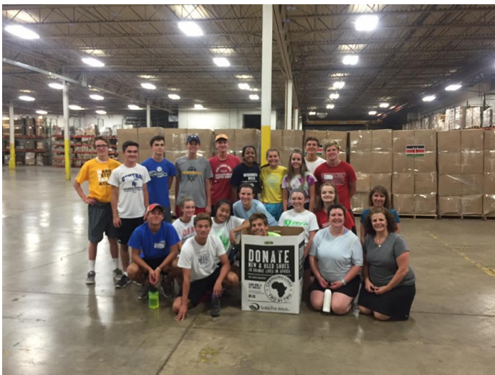
We enjoyed serving with the youth from St. John Vianney of Brookfield this month!