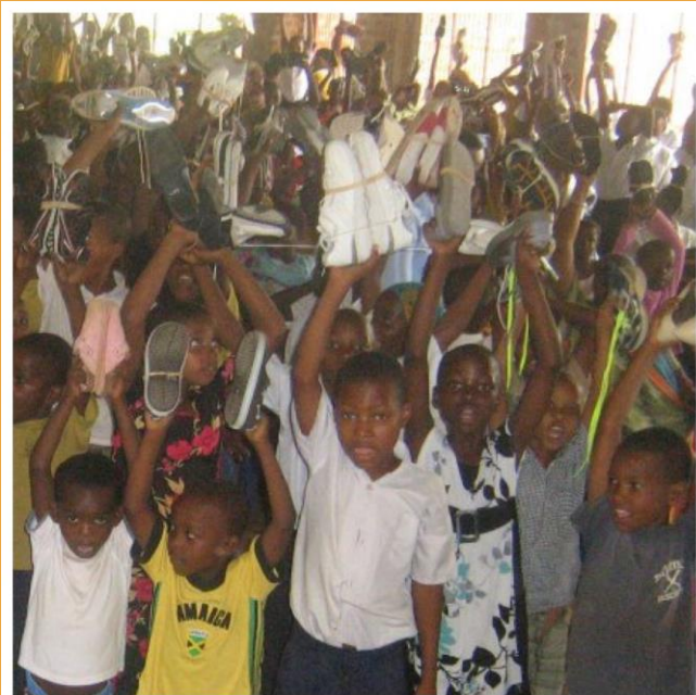
Children thanking God for their shoes.

Due to political tension in Mozambique, shoe distributions are still on hold. Please continue to pray for peace in this nation and that our partners will soon be able to resume distributions freely and effectively in Jesus' name. View pictures of this distribution HERE .