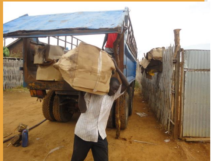
Carrying boxes of shoes to a shoe distribution.