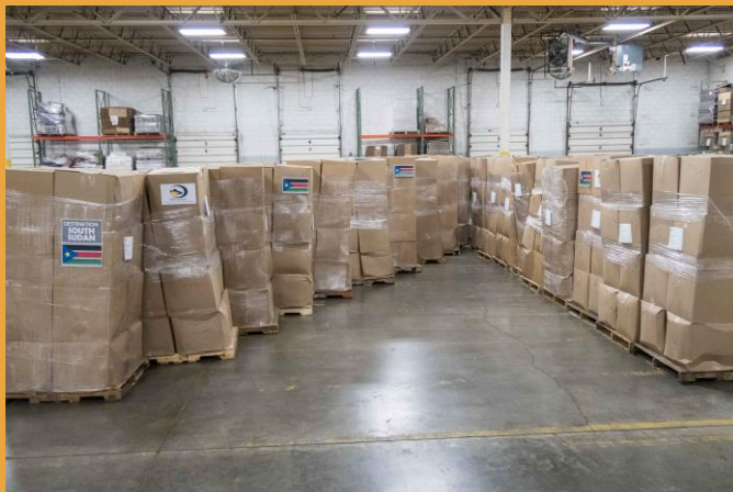
The South Sudan shipment before it left the SFJ warehouse.

18,000 pairs of shoes are currently traveling to South Sudan. This is the first 40-foot container that SFJ has shipped to Africa. Thousands of refugees will receive this gift and hear about Jesus. We're thankful for the generous donation of shoes and funds that helped make this possible. Please pray for the hearts who will receive shoes and hear the Good News of Jesus in the coming months. View pictures of this shipment HERE .