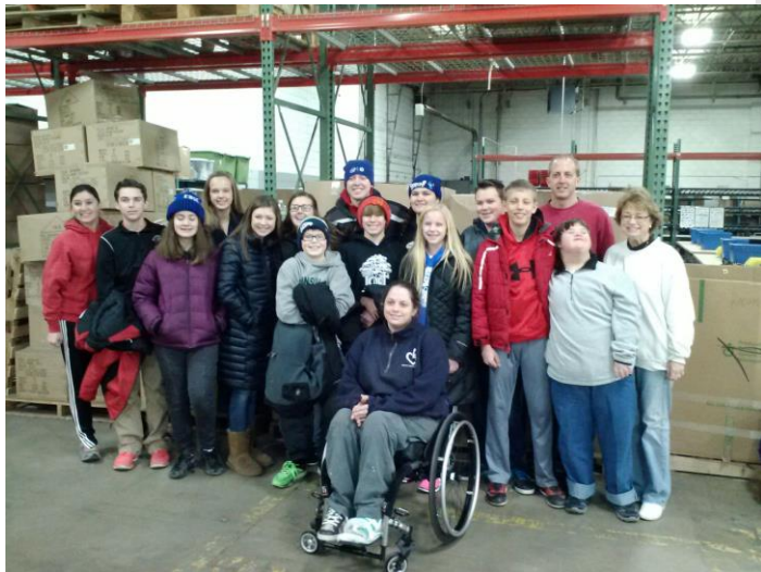
We enjoyed serving with the youth of Spring Creek Church this month!