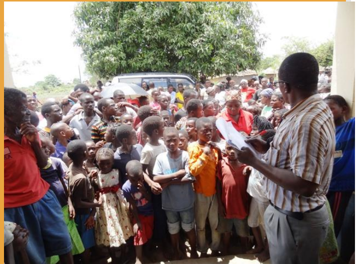
Children waiting to receive shoes in Mozambique.