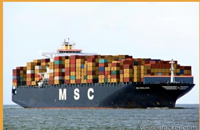
The MSC Brunella transporting 8,000 pairs of shoes to Tanzania.

8,000 pairs of shoes left our warehouse for Tanzania! This is the shipment that our mission team will help distribute in May. Please pray for a quick and smooth delivery, and for the Lord to prepare the hearts of those we will serve. Our team is excited for this opportunity to be the hands and feet of Jesus in this nation. View pictures of this shipment HERE .