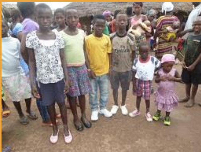
New shoes on the feet of children in Guinea-Bissau.