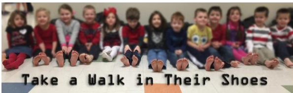
Preschoolers at LCA going barefoot for a day.