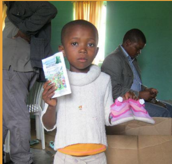
A little girl with her new shoes and a Gospel booklet in her own language from World Missionary Press.