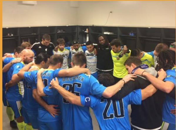
The Milwaukee Wave soccer team.

Please mark your calendar and invite your family and friends to join us for a 5k or 2 mile run or walk on Saturday, June 25th . The event will start and end at the beautiful campus of Waukesha County Technical College and we'll enjoy a scenic route through the streets of Pewaukee. The morning will also include medals, prizes, refreshments, exciting games and players from the Milwaukee Wave soccer team will be joining us too! Online registration will