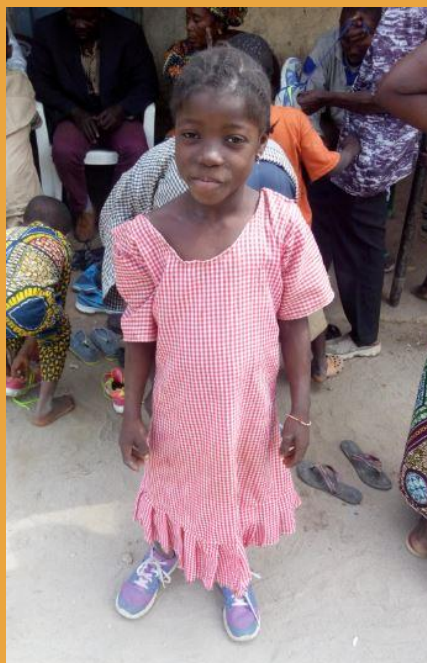
A happy girl with new shoes on her feet!