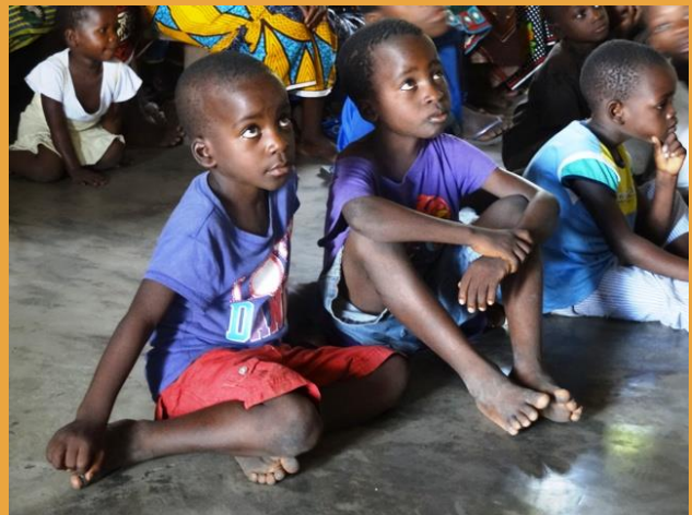
Children hearing about Jesus at a shoe distribution.