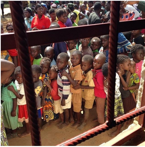
Children waiting in line for shoes in Zambia.