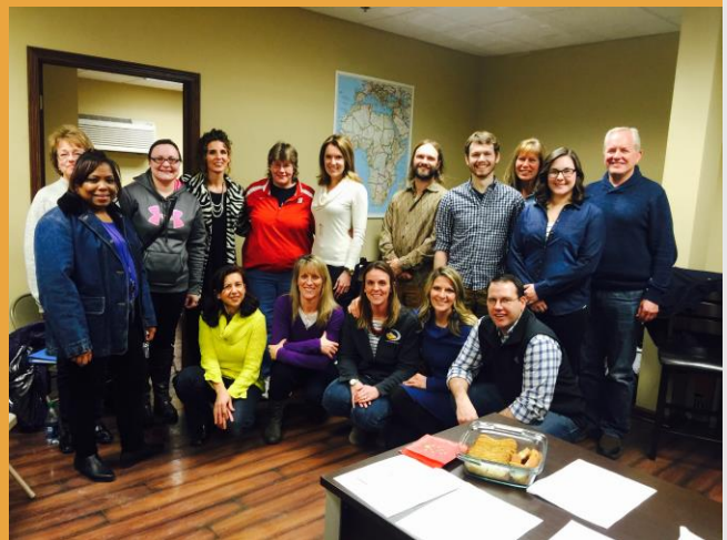
The SFJ Mission Team Tanzania 2016!

We are thrilled to introduce the team who will be distributing shoes and sharing the love of Jesus in Tanzania this May. It was exciting to meet together for the first time last week, and we are looking forward to being the hands and feet of Jesus in this nation. Please pray for the people of Tanzania, and for our shipment of shoes to safely reach our ministry partner. View pictures of this shipment HERE .