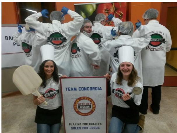
Students who participated in the Mission Pizza Games.

Concordia University Wisconsin- We are thankful for our friends at Concordia University who recently participated in the Mission Pizza Games, hosted by Mission Pizza Co. The students pictured below competed against three other local universities by making pizzas. The winner of the competition was able to make a donation to their charity of choice. For every five Palermo's pizzas sold, one was donated to a local food bank. Hats off to these students from Concordia!