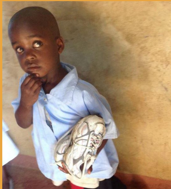
A young boy after receiving shoes.