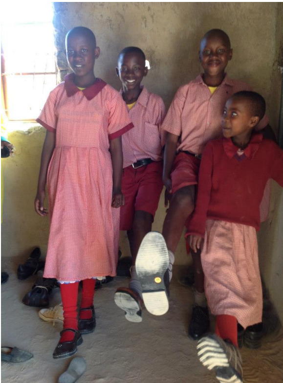
Students in Kenya sharing their joy, as they kick up their heels.

wisdom and favor, and for hearts to be opened to Jesus in each village and place they visit. See photos of this shipment HERE