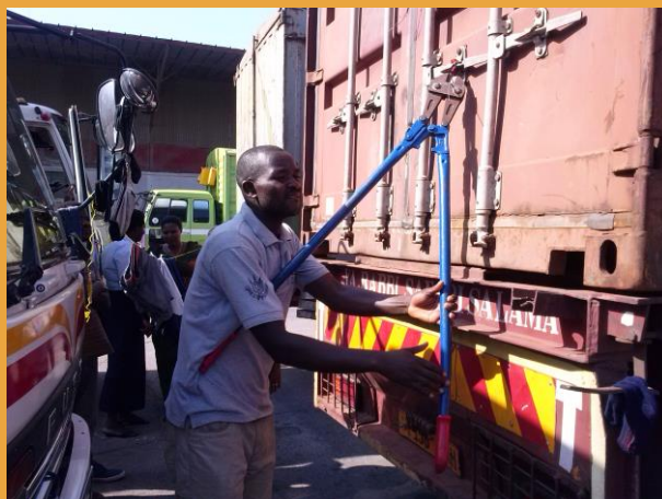
A port worker inspecting the container of shoes before releasing it to our partners.