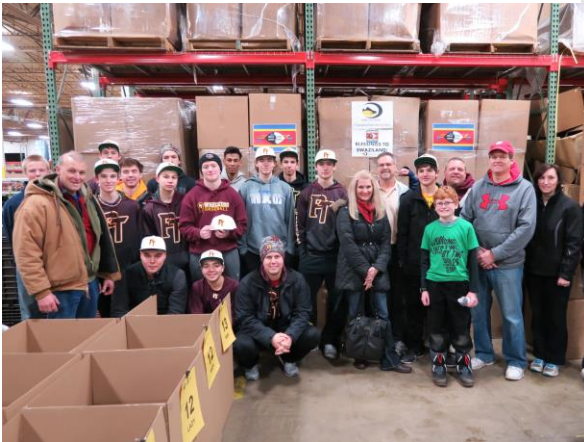
Players and parents of the Pound Town Baseball Team volunteering at a SOS Event.