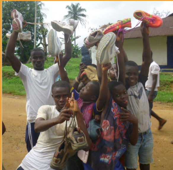
People in Sinoe County, celebrating the gift of shoes.