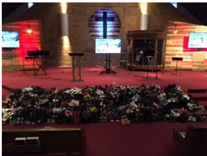
Shoes left at the altar to be donated to SFJ.