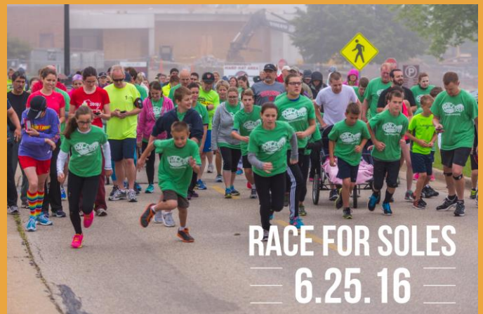
The starting line of Race For Soles 2015.

Mark your calendar and invite your friends and family to our third annual Race For Soles on June 25, 2016! We look forward to sharing more details with you soon.