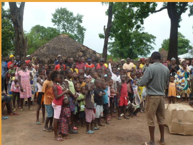
A crowd gathering to hear about Jesus before a shoe distribution in Guinea-Bissau.