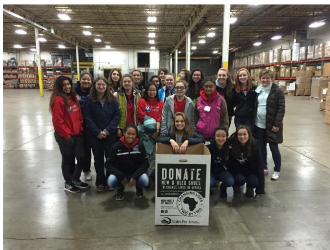
We enjoyed serving with students from Heritage Christian High School this month!