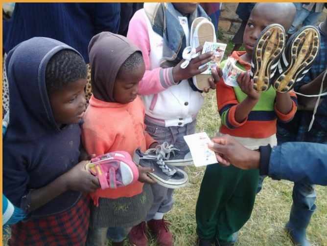
Children receiving shoes and a Gospel booklet in Lesotho.