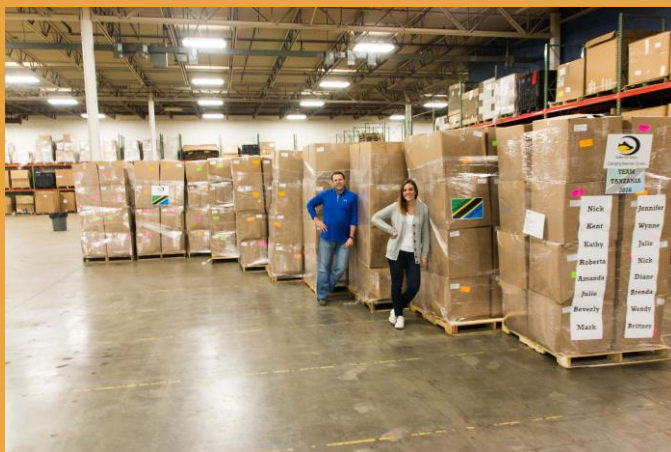
Please pray for Team Tanzania, as you can see their names on the shipment.