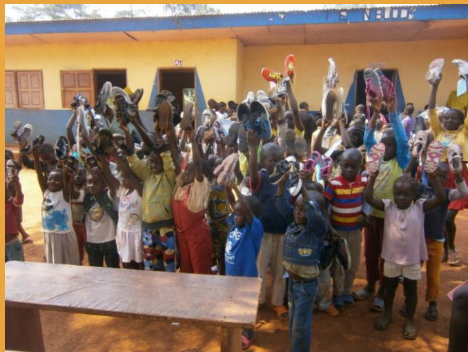
Children with their new Christmas shoes!