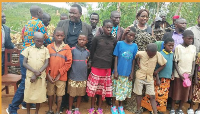
Children with new shoes on their feet in Burundi!