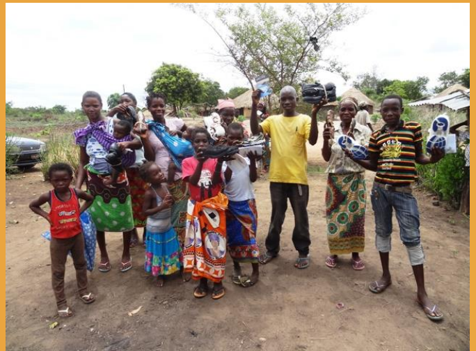
Excited to show their new shoes!